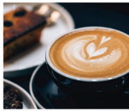
Coffee & Tea