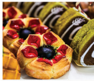
Bakery & Light Meal