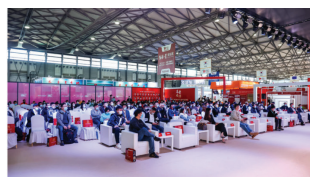
Summits & Forums