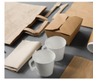
Food Processing & Packaging