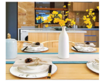
Prefabricated Dishes & Central Kitchen