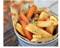
Catering Supply Chain & Raw Material