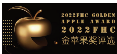
FHC Golden Apple Award