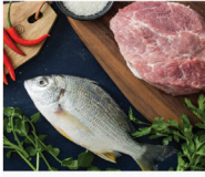
Meat & Aquatic Product