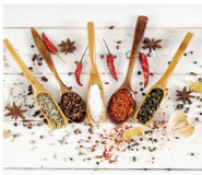
Condiments & Oil