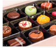
Sweets & Chocolate