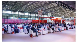
Summits & Forums