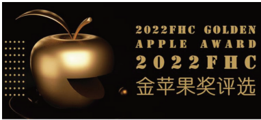
FHC Golden Apple Award